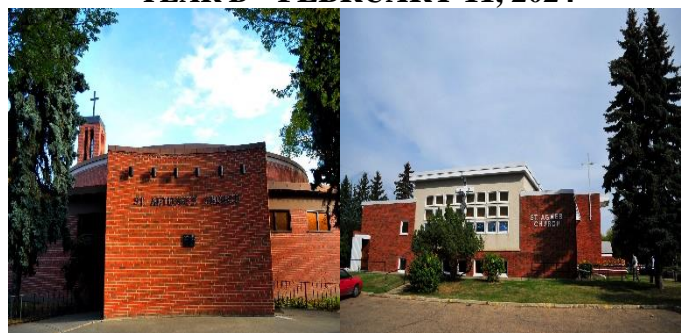
St. Anthony 10661-82 Avenue

SIXTH SUNDAY IN ORDINARY TIME YEAR B – FEBRUARY 11, 2024